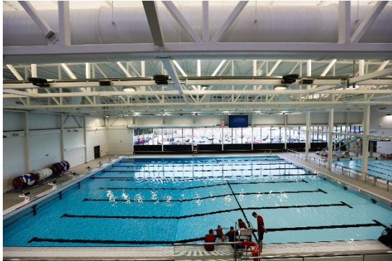
Lisnasharragh Leisure Centre